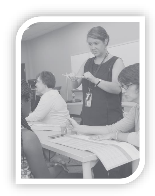
V. Social Services, Rehabilitation Counseling and Allied