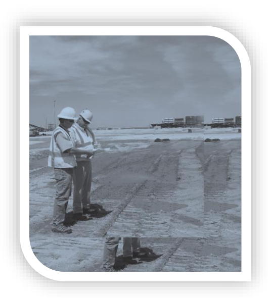
IX. Maintenance and Operations