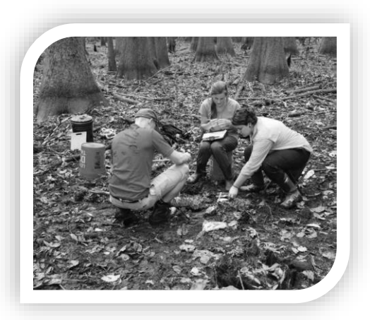
III. Education, Museum and Library