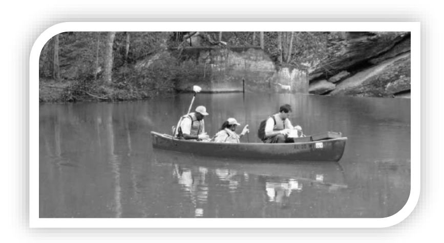
VII. Agriculture, Forestry and Conservation